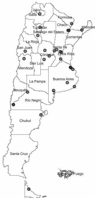
Figure 1: Location of Technology Cluster Initiatives in Argentina

attract new business opportunities, position Córdoba globally, and enlarge the pool of skilled workers by partnering with local universities and other training institutions. In fact, shortly after formally establishing the organization, the CTC, with the support of Intel –which had donated IT equipment to local universities years in advance of opening its local affiliate– brought together the six main universities in Córdoba and formed the Córdoba Technological Institute (CTI). The CTI was one of the first endeavors of the organization and was instrumental in adapting graduate and undergraduate curricula to the needs of the local industry. As the CTC matured, it began to have an increasing influence on the design of public policies aimed at the software and IT services sectors.