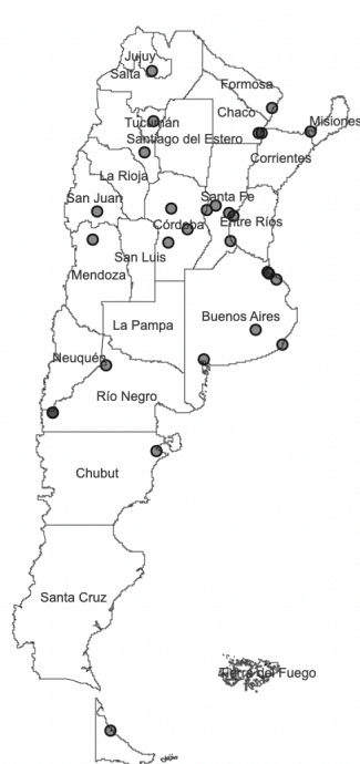
Figure 1: Location of Technology Cluster Initiatives in Argentina

attract new business opportunities, position Córdoba globally, and enlarge the pool of skilled workers by partnering with local universities and other training institutions. In fact, shortly after formally establishing the organization, the CTC, with the support of Intel –which had donated IT equipment to local universities years in advance of opening its local affiliate– brought together the six main universities in Córdoba and formed the Córdoba Technological Institute (CTI). The CTI was one of the first endeavors of the organization and was instrumental in adapting graduate and undergraduate curricula to the needs of the local industry. As the CTC matured, it began to have an increasing influence on the design of public policies aimed at the software and IT services sectors.