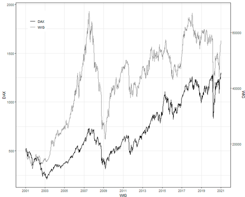
Figure 1. Time series of WIG and DAX index, 2001–2020

Based on these prices, the logarithmic weekly rates of return were calculated as R_{it} = \ln P_{it} - \ln P_{it-1} , where R_{it} is the logarithmic rate of return on the i -th index at time t , and P_{it} is the price of the i -th index at time t . The rates of return on industry indices were calculated without dividends. For each industry, we received 1043 observations of return in the period 2001–2020 (20 years). Data were obtained from the Refinitiv EIKON database, and all tables are labeled with the RIC (Reuters Instrument Code). They formed the basis for the present research. Figure 1 presents the time series of the WIG and DAX index.