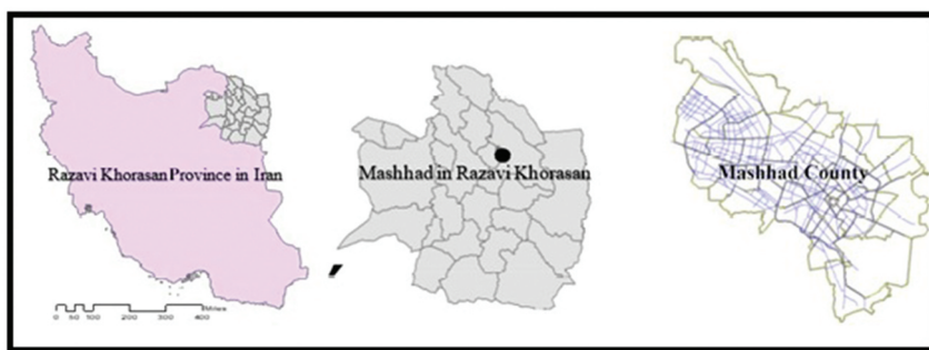
Figure 2. Geographical location of the study area in Mashhad County, Iran.