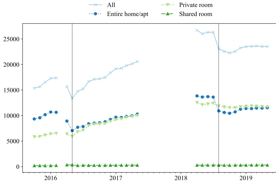
Figure 1: The number of Airbnb listings in Berlin over time, split by types of Airbnb listings. Own calculations based on data from insideairbnb.com.