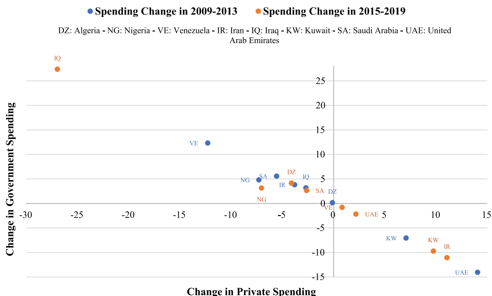
Table 2. Welch's t-test results for changes in healthcare spending in 2009–2013 and 2015–2019 compared to 2003–2007