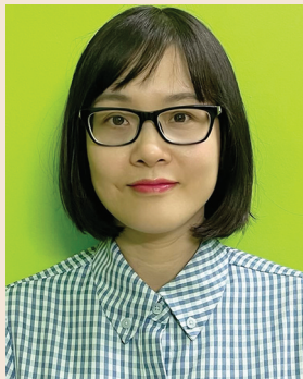
Thu Hien Nguyen

Abstract: Vietnam's pulp and paper industry has contributed significantly to socio-economic growth but is also one of the industries with a very high risk of environmental pollution. Stems from the goal of economic growth coupled with environmental protection operations in Vietnam, this study examines the factors affecting the implementation of environmental management accounting (EMA) in manufacturing enterprises in Vietnam's pulp and paper industries. The data used in the study were collected through survey questionnaires in the form of face-to-face interviews or sent by e-mail or post to survey respondents at 290 manufacturing enterprises pulp and paper in provinces and cities of Vietnam. Survey subjects are managers (directors, deputy directors, chief accountants) and accountants who have knowledge of EMA in these enterprises. The survey results