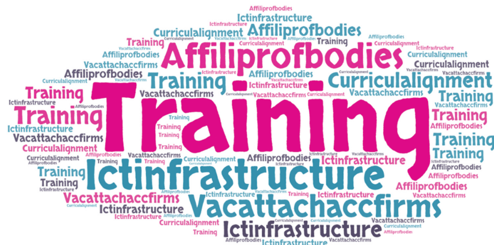
Figure 4. What needs to be done.

Training programmes offered by international bodies offer relevant skills. (Interviewee 17)