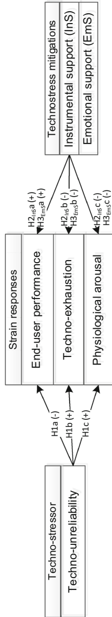
Fig. 1 Research model