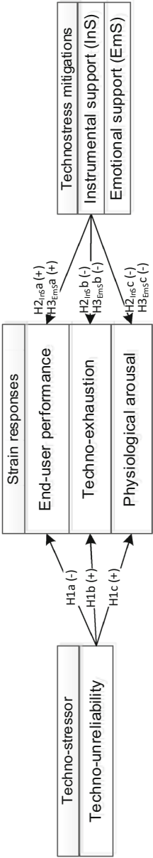
Fig. 1 Research model