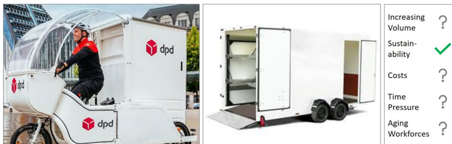
Fig. 2 Cargo bike (left), Mobile depot (middle), and evaluation (right)

Note that we evaluate each discussed delivery concept with regard to its potential contribution to the five major challenges of last-mile logistics discussed in Sect. 1. We rate each concept's contribution to each of the challenges in relation to