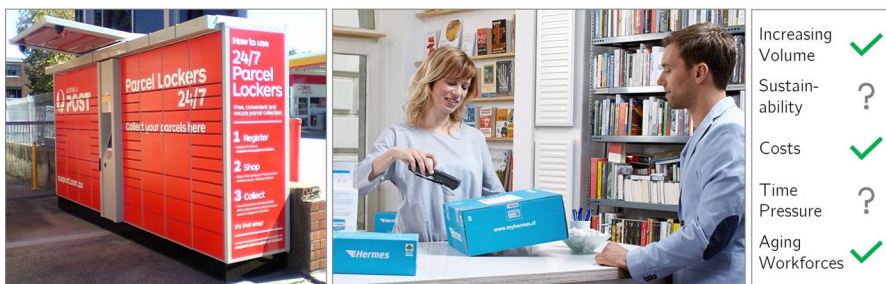
Fig. 3 Customer self-service: Parcel locker of the Australian Post (left; Source : Worthington 2014), Self-service in a book store (middle; Source : Hermes 2016), and evaluation (right)

Compared to home delivery, the batched delivery of multiple customers' parcels to a decentralized pickup location saves effort for the postal service provider, which facilitates handling increasing parcel volumes, tends to lower costs, and relieves the (aging) workforce. This, however, is just one side of the trade-off. Self-serving customers give up convenience and have to travel toward their respective pickup locations. This may delay the final receipt of a shipment and may require incentives (e.g., lower postal fares) to convince customers to participate in self-service. Furthermore, the saved travel effort of the postal service provider is to be traded off against the additional travel of customers toward the self-service location. Thus, also from an environmental perspective it is not self-evident that customer self-service reduces travel-induced environmental impact, but depends whether a customer makes an additional drive by car between her home and the self-service station or passes by the pickup location on the way back home anyway. Our evaluation of customer self-service compared to the status-quo delivery option with regard to the five challenges identified in Sect. 1 is summarized in Fig. 3 (right). Especially, the questions on the right incentives and the total environmental impact of self-service are important