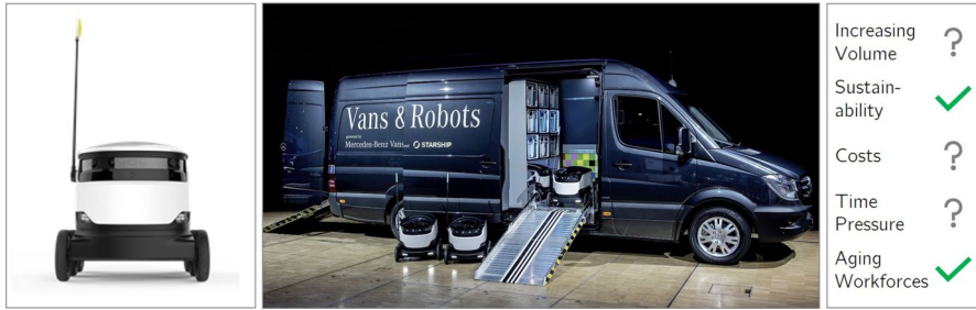
Fig. 5 Autonomous delivery bot (left; Source : Starship Technologies 2020) launched from a van (middle; Source : Daimler 2016a), and evaluation (right)

selling or currently developing delivery robots. Compared to drones, autonomous delivery bots have different pros and cons: Bots travel in pedestrian speed of about 6km/h on side-walks, which considerably slows down their delivery speed, but allows them to move slightly heavier shipments up to 10kg (Starship Technologies 2015). Whereas a drone has to be supervised by a dedicated flight operator during all time and is not allowed in neuralgic areas, e.g., close to airports (FAA 2018), bots face less security regulations, so that, in different field tests, one operator was allowed to supervise dozens of bots (Bakach et al. 2020). In addition, apart from no-fly zones (e.g., security areas) and obstacles (e.g., large buildings), drones can fly directly from A to B while robots tied to the existing road network. These technical specifications rather influence the input data of decision problem, e.g., cost parameters, operating ranges, and payloads, so that our evaluation of delivery bots with regard to our five challenges of Sect. 1 is similar to that of drones (see Fig. 5, right). The only deviation is that—due to their slow delivery speeds—bots can barely relieve the time pressure of last-mile distribution. However, the bots are already used in practice, e.g., by Hermes in Hamburg and London (Bertram 2017), the German post (T3n 2017), and Amazon (Dormehl 2020) for parcel delivery or for pizza delivery in German and Dutch cities (Starship Technologies 2017).