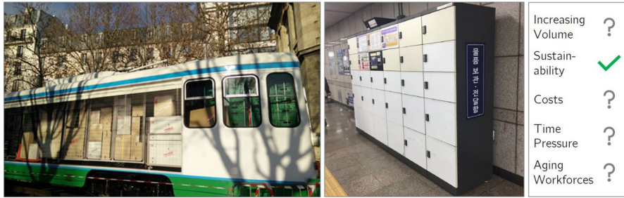
Fig. 7 Tram Fret in Saint-Étienne (left), parcel lockers in a Seoul subway station (middle), and evaluation (right)

remain questionable. The need for a close synchronization of multiple delivery modes increases planning complexity, and it depends how efficiently this planning task can be resolved whether a combination of goods and people transport can meet the high demands of today's last-mile logistics.