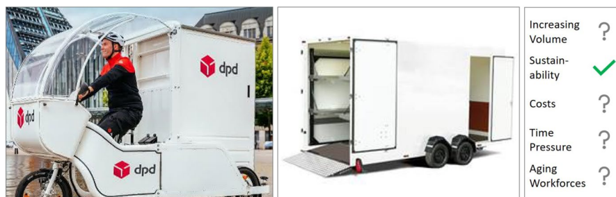
Fig. 2 Cargo bike (left), Mobile depot (middle), and evaluation (right)

Note that we evaluate each discussed delivery concept with regard to its potential contribution to the five major challenges of last-mile logistics discussed in Sect. 1. We rate each concept's contribution to each of the challenges in relation to