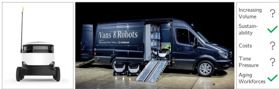
Fig. 5 Autonomous delivery bot (left; Source : Starship Technologies 2020) launched from a van (middle; Source : Daimler 2016a), and evaluation (right)

selling or currently developing delivery robots. Compared to drones, autonomous delivery bots have different pros and cons: Bots travel in pedestrian speed of about 6km/h on side-walks, which considerably slows down their delivery speed, but allows them to move slightly heavier shipments up to 10kg (Starship Technologies 2015). Whereas a drone has to be supervised by a dedicated flight operator during all time and is not allowed in neuralgic areas, e.g., close to airports (FAA 2018), bots face less security regulations, so that, in different field tests, one operator was allowed to supervise dozens of bots (Bakach et al. 2020). In addition, apart from no-fly zones (e.g., security areas) and obstacles (e.g., large buildings), drones can fly directly from A to B while robots tied to the existing road network. These technical specifications rather influence the input data of decision problem, e.g., cost parameters, operating ranges, and payloads, so that our evaluation of delivery bots with regard to our five challenges of Sect. 1 is similar to that of drones (see Fig. 5, right). The only deviation is that—due to their slow delivery speeds—bots can barely relieve the time pressure of last-mile distribution. However, the bots are already used in practice, e.g., by Hermes in Hamburg and London (Bertram 2017), the German post (T3n 2017), and Amazon (Dormehl 2020) for parcel delivery or for pizza delivery in German and Dutch cities (Starship Technologies 2017).