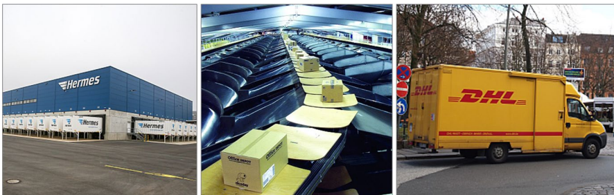
Fig. 1 Parcel sorting center (left), tilt-ray sorter (middle), and delivery van (right)

In the parcel carrier industry, shipments arrive at the central depot (see Fig. 1, left) dedicated to an urban area after long-haul transportation by truck, typically from other depots or hubs. Once docked at an unloading dock, trailers are opened, and shipments are successively unloaded onto a conveyor. Many terminals of the postal service industry apply telescope conveyors, which can be extended into a trailer, to reduce the workers' physical unloading effort. The conveyors connect the central sorting system, which is often a loop-shaped conveyor consisting of tilt trays, as displayed in Fig. 1 (middle). Addressees of shipments are automatically recognized, e.g., by OCR software or scanning a barcode, shipments are isolated each onto a separate tray, and circle through the terminal. Alternative sortation technology (e.g., applying cross belts or sliding shoes) is elaborated in Boysen et al.