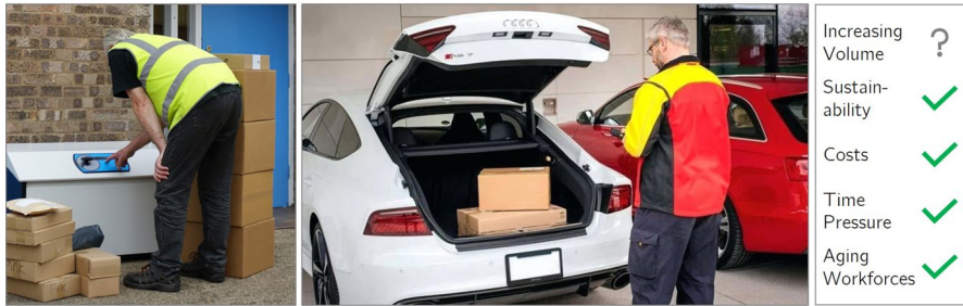
Fig. 8 Reception box PinPod (left), trunk delivery by DHL (middle), and evaluation (right)

reception boxes, e.g., at the home yard or the garage (see Fig. 8, left), smart door locks that allow the delivery person to open the front door of a private home with a smartphone app (Amazon 2020), and delivery into the trunks of private cars (see Fig. 8, middle). The latter, for example, was successfully implemented in a cooperation between DHL and Volkswagen (DHL 2017).