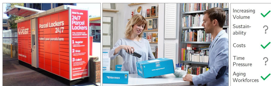
Fig. 3 Customer self-service: Parcel locker of the Australian Post (left), Self-service in a book store (middle), and evaluation (right)

Compared to home delivery, the batched delivery of multiple customers' parcels to a decentralized pickup location saves effort for the postal service provider, which facilitates handling increasing parcel volumes, tends to lower costs, and relieves the (aging) workforce. This, however, is just one side of the trade-off. Self-serving customers give up convenience and have to travel toward their respective pickup locations. This may delay the final receipt of a shipment and may require incentives (e.g., lower postal fares) to convince customers to participate in self-service. Furthermore, the saved travel effort of the postal service provider is to be traded off against the additional travel of customers toward the self-service location. Thus, also from an environmental perspective it is not self-evident that customer self-service reduces travel-induced environmental impact, but depends whether a customer makes an additional drive by car between her home and the self-service station or passes by the pickup location on the way back home anyway. Our evaluation of customer self-service compared to the status-quo delivery option with regard to the five challenges identified in Sect. 1 is summarized in Fig. 3 (right). Especially, the questions on the right incentives and the total environmental impact of self-service are important