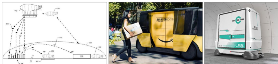
Fig. 9 Patent drawing for flying warehouse (left; Source : Berg et al. 2016), mobile parcel locker called Hannah (middle; Source : Teague 2020), and tunnel-based cargo transport with an automated guided vehicle (right; Source : CST 2020)

If an aircraft moving through the sky (or a vessel traveling on open sea) is applied as a mobile launching platform, this leads to delivery concepts [depot>aircraft>drone>uHome] (or [depot>vessel>drone>uHome]). In this case,