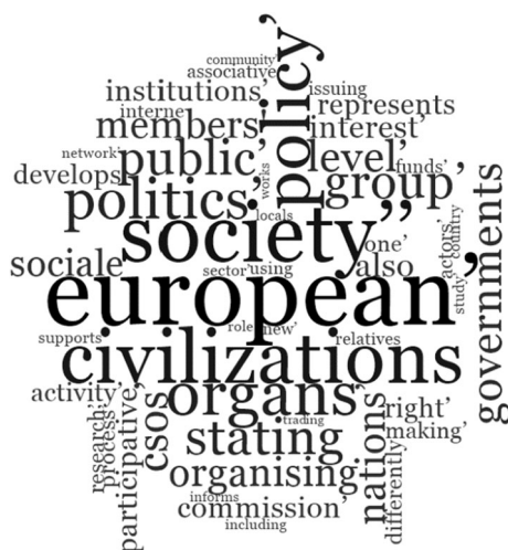
Fig. 5 Civil society organisation frame

Indeed, discussions of CSOs’ less favourable features are slow to emerge (e.g. Chambers and Kopstein 2001) and much empirical and theoretical work remains in order to understand how positively viewed normative notions of participatory and deliberative democracy embedded in the civil society frame play out in practice.