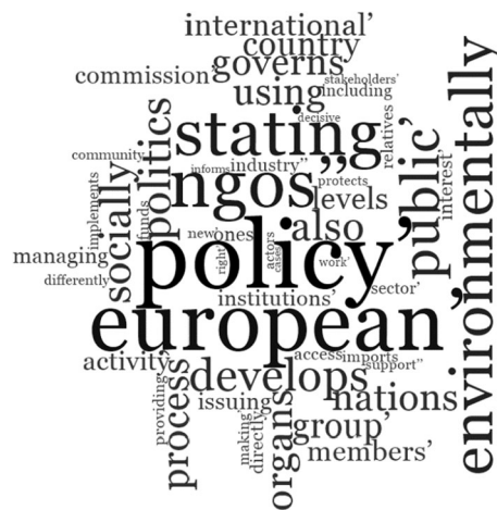
Fig. 4 NGO frame

Correspondingly, researchers use civil society ideas in three broad ways (Keane 2010): as an ‘idealtyp’ in empirical investigations of its origins and nature; in pragmatic ways, where ‘strategic usages of the term have an eye for defining what must or must not be done’ (p. 463); or normatively, where civil society stands for an expression