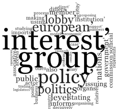
Fig. 3 Interest group frame

but also to the fact that NGOs tend to be very diverse organisations (Lewis 2010). Lewis (2010) argues that NGO activities may be understood in two broad categories: service provision and political advocacy. Many of the NGOs active in the EU are indeed ‘umbrella organisations’ performing political advocacy for a range of NGOs in their membership (Melville 2010), or they represent globally active organisations such as Greenpeace or the WWF.