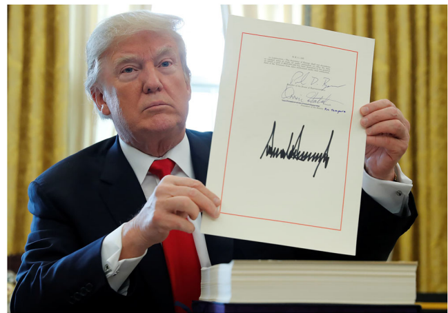
FIGURE 1 Donald Trump's signature on the tax overhaul plan

Based on this research, argumentation, and validation, many researchers have followed the approach of using signature sizes as a