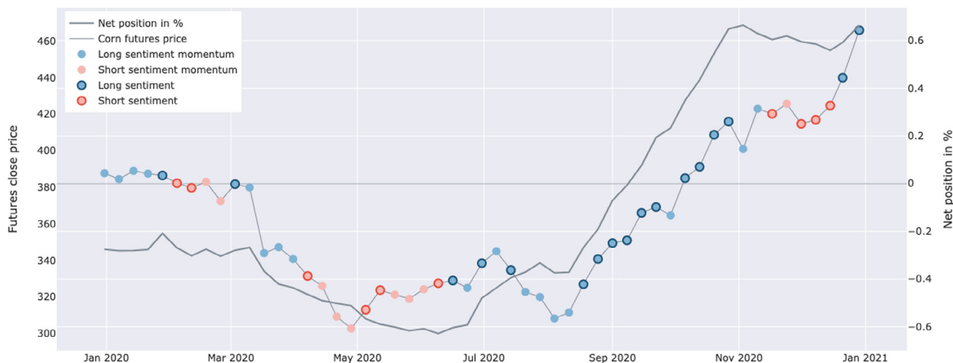
FIGURE 1 Sentiment periods of long-short speculators. The blue (red) outlined points mark the end of weekly long (short) sentiment periods in which long-short speculators increase their long (short) corn futures positions and decrease their short (long) corn futures positions. The non-outlined points mark the end of weekly neutral sentiment periods in which long-short speculators increase or decrease their long and short corn futures positions simultaneously. A blue (red) non-outlined point means that the weekly period follows a recent long (short) sentiment period (sentiment momentum). All sentiment and sentiment momentum periods are projected to the price time series of the corn’s front contract futures for the period from 31 December 2019 to 29 December 2020. The dark grey line marks the long-short speculator’s net futures position in percent of its open interest. A net position of 1.0 (−1.0) means that the long-short speculator’s open interest is made up of long (short) positions only [Colour figure can be viewed at wileyonlinelibrary.com ]