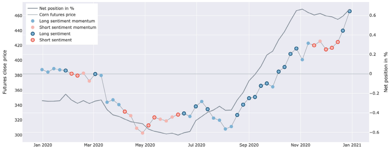
FIGURE 1 Sentiment periods of long-short speculators. The blue (red) outlined points mark the end of weekly long (short) sentiment periods in which long-short speculators increase their long (short) corn futures positions and decrease their short (long) corn futures positions. The non-outlined points mark the end of weekly neutral sentiment periods in which long-short speculators increase or decrease their long and short corn futures positions simultaneously. A blue (red) non-outlined point means that the weekly period follows a recent long (short) sentiment period (sentiment momentum). All sentiment and sentiment momentum periods are projected to the price time series of the corn's front contract futures for the period from 31 December 2019 to 29 December 2020. The dark grey line marks the long-short speculator's net futures position in percent of its open interest. A net position of 1.0 (−1.0) means that the long-short speculator's open interest is made up of long (short) positions only [Colour figure can be viewed at wileyonlinelibrary.com ]