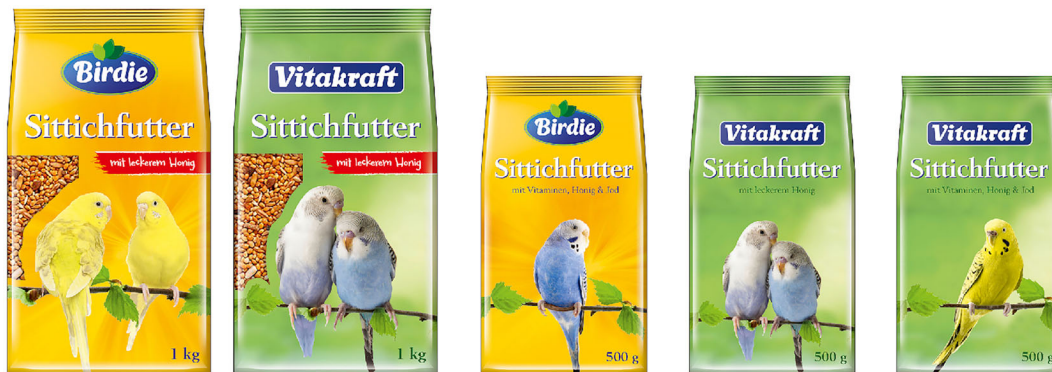
FIGURE 2 Products presented in Study 1, Choice Task 6. Attributes and features: Number of birds (two vs. one); size (large package [1 kg] vs. small package [500 g]); brand (fictitious vs. real); bird color (blue vs. yellow); package color (blue/green vs. ocher/yellow); product window (available vs. not available); ingredients (with tasty honey vs. with vitamins); ingredients' background color (red vs. no color); appeal (hard vs. soft).

design consisted of 80 product images distributed across 16 choice tasks. Participants were forced to choose between the five product images. This design was 100% efficient, implying that each attribute occurred with equal frequency, namely, 80 times. Further, each feature mentioned in Figure 2 occurred with equal frequency, namely, 40 times, and each feature repeated itself with minimum frequency in a choice task. For example, participants could choose between three large and two small products, and vice versa.