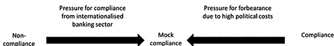
Figure 1 Conditions leading to mock-compliance.

The third condition is rooted in the literature on structural power and its contention that governments face strong pressures to maintain high levels of investment to achieve the level of economic prosperity necessary to maintain popular support and finance the state apparatus (Block 1977; Lindblom 1977). This provides governments with strong incentives to employ policies responsive to the major providers of capital (Winters 1996; Bell & Hindmoor 2014; Woll 2014; Fairfield 2015). Arising from a perceived threat of reduced investment in response to a government policy, the structural power of business is distinct from instrumental power, defined as concerted