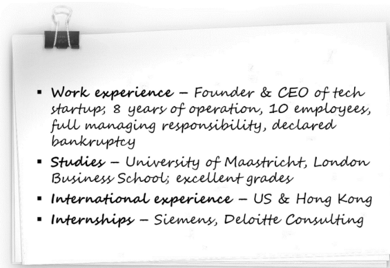
Figure 2. Scenario A: Study 1 experiment summary note for scenario A. Scenario B: Study 1 experiment summary note for scenario B. Scenario C: Study 1 experiment summary note for scenario C