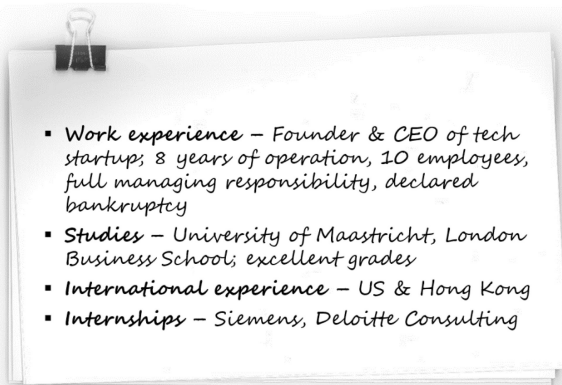
Figure 2. Scenario A: Study 1 experiment summary note for scenario A. Scenario B: Study 1 experiment summary note for scenario B. Scenario C: Study 1 experiment summary note for scenario C