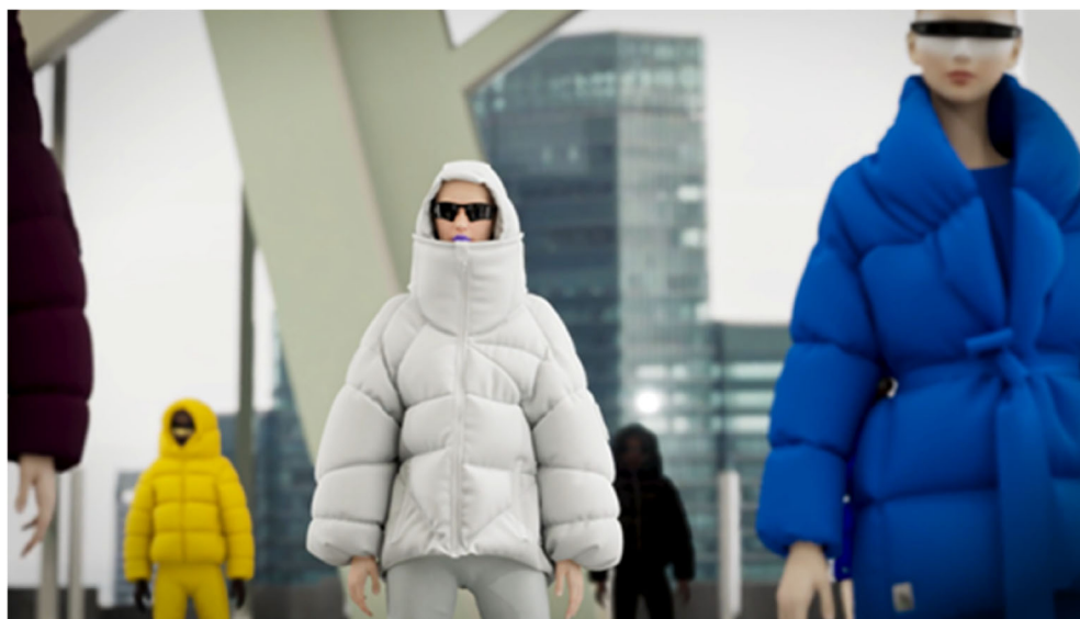
FIGURE 3 Virtual presentation of the Bacon’s version collection.

“The metaverse and 3D reality turn our preconceptions upside down. Because Gen Z’s are digital natives, we’ll create and dress avatars. This is a huge playground for the fashion business,” argued TwinOne’s founder. “Many businesses have digital strategy based on digitized