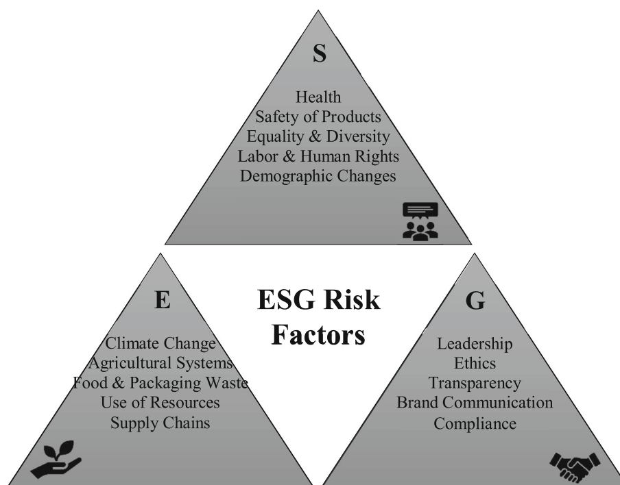
FIGURE 1 Overview of ESG risk factors in the food industry.

potential risks to the food supply of future generations (Smetana et al., 2020).