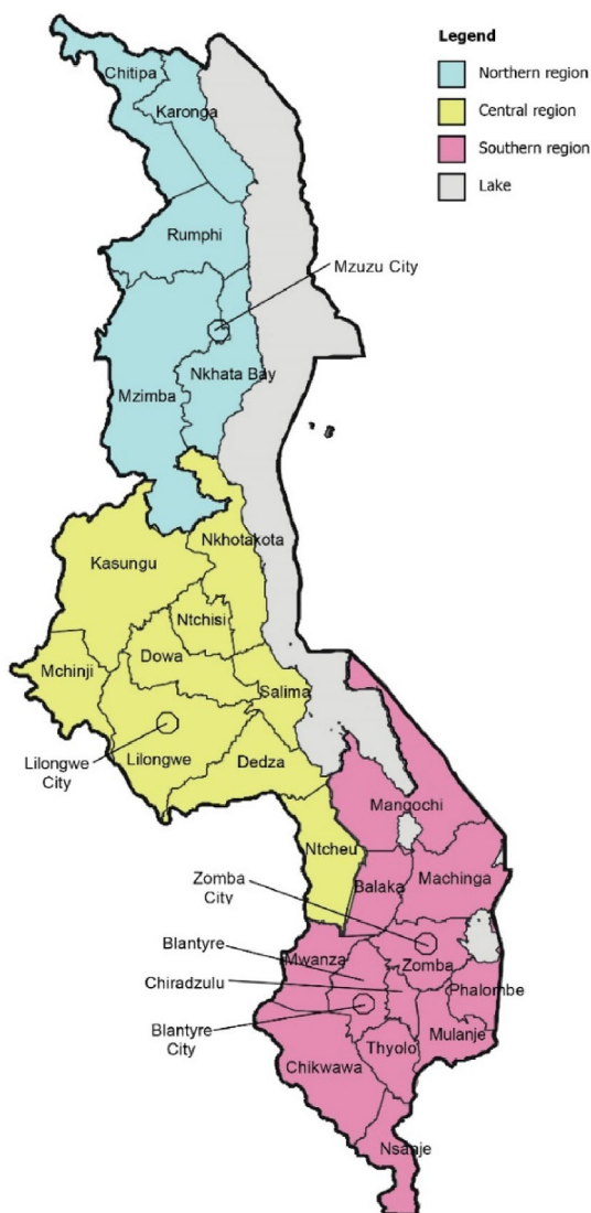
FIGURE 1 Map of Malawi with districts and administrative zone. [Colour figure can be viewed at wileyonlinelibrary.com ]

We use pooled cross-sectional data from the Malawi DHS for 2004/05, 2010, and 2015/16. The data are representative of households within the 26 main districts in Malawi (see Figure 1). For detailed insight into the DHS sampling strategy see Croft et al. (2018). Our cross-sectional datasets are limited to households with women who indicated that they were employed or self-employed in agriculture in all three timeframes of the Malawi DHS. Going forward, we describe