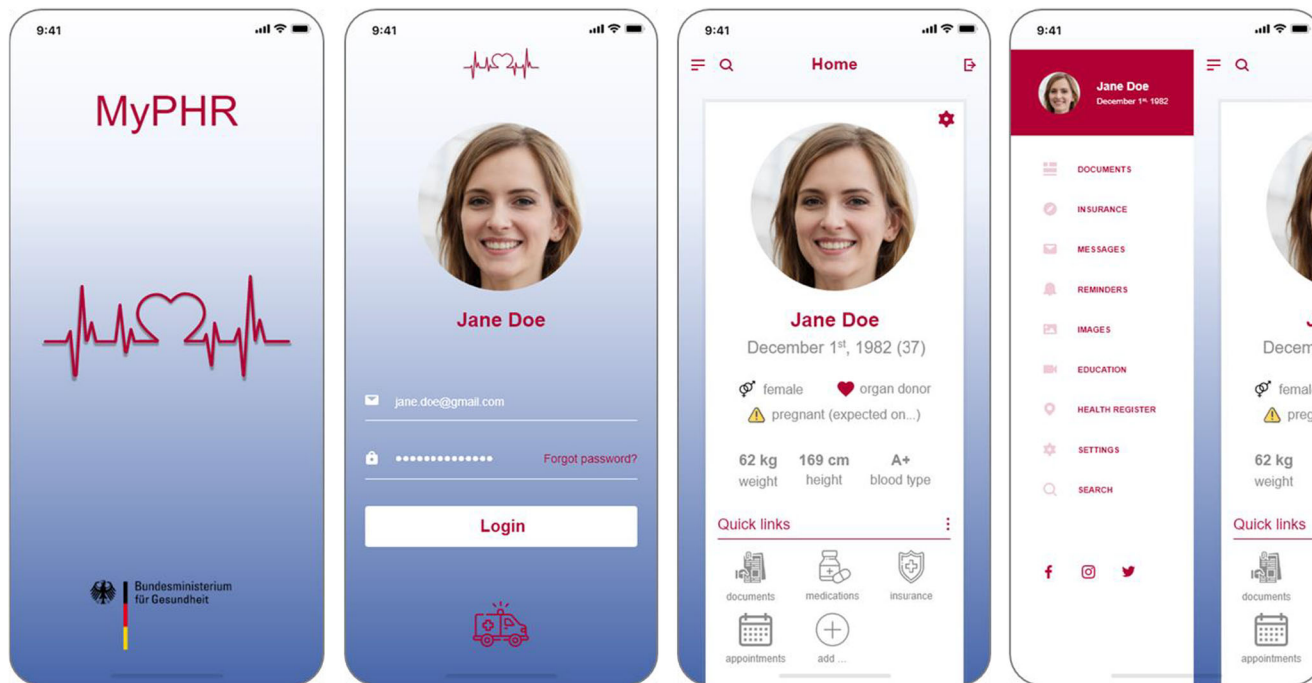
Fig. 4 Exemplary screenshots of a fictional PHR