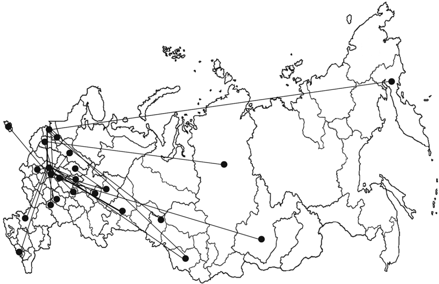
Fig. 3 Inventor Mobility across the Regions of the Russian Federation 1992–2008

between Moscow and St. Petersburg as well as the between Moscow and the Moscow oblast report two-way mobility.