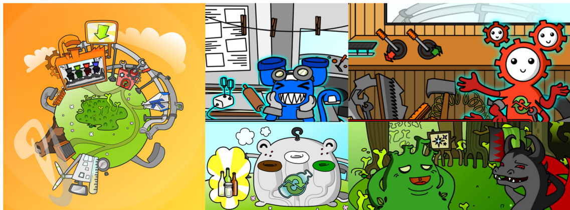
Fig. 1 Game aesthetics of the unabridged game

Establishing a fun core gameplay is of great importance before proceeding to the design and implementation of any other design elements (Järvinen 2007; Sicart 2008). We tested the core gameplay extensively with over 20 play-testers. The game went through several iterations before the parameters were finally set. The tests were conducted in the manner of the quiet observer, as is common in user experience testing, with a follow-up session to discuss the highlights and flaws and make suggestions for the gameplay mechanism.