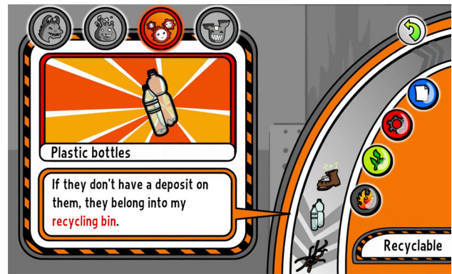
Fig. 4 Look-up Element (original game texts were in German)

mechanics of this look-up design element, two game design elements that serve to offer additional information to the players inspired us. First, we drew insights from the interactive “hint” functions found in puzzle games and point-and-click adventures like Machinarium (Amanita Design 2009). These hints are designed to reduce frustration by guiding the players with incremental tips. They are optional, so players decide for themselves when and if they want to use them. The second inspirational game design element is the pokedex used in the Pokémon (Game Freak, 1996) game series: a lexicon-based design element that gradually lists all monsters and their related meta-data that players encounter during the game.