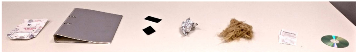
Fig. 8 Real-life waste items