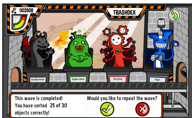
Fig. 3 Repeat element (original game texts were in German)

In his article, Gee (2003) elaborated on the placement of information: that it should be given “on demand” and applied soon after having read it. He based this on people’s poor understanding and retention of information received out of context (Brown et al. 1989; Barsalou 1999; Glenberg and Robertson 1999). The look-up element (see Fig. 4) is an index that can be used to find all previously encountered waste items. For each item, it shows the correct target bin, as well as additional information on why the item belongs there and not in another bin. It can be accessed at any point throughout the game by simply opening it or by pulling an item on top of it (it then scrolls directly to that item). It is introduced in the tutorial and its usage penalty-free. For the