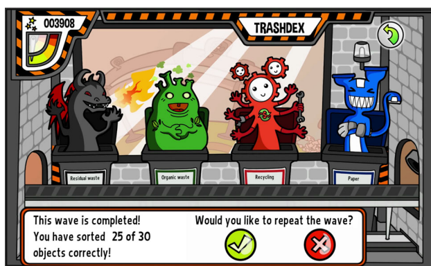
Fig. 3 Repeat element (original game texts were in German)

In his article, Gee (2003) elaborated on the placement of information: that it should be given “on demand” and applied soon after having read it. He based this on people’s poor understanding and retention of information received out of context (Brown et al. 1989; Barsalou 1999; Glenberg and Robertson 1999). The look-up element (see Fig. 4) is an index that can be used to find all previously encountered waste items. For each item, it shows the correct target bin, as well as additional information on why the item belongs there and not in another bin. It can be accessed at any point throughout the game by simply opening it or by pulling an item on top of it (it then scrolls directly to that item). It is introduced in the tutorial and its usage penalty-free. For the