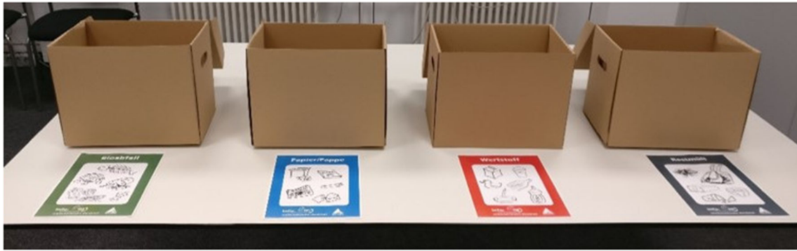
Fig. 7 Representative waste bins: bio, paper, recycle, residual