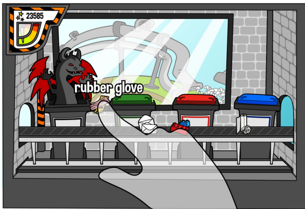
Fig. 2 Metaphorical representation (mapping) of the waste sorting process in the core gameplay of the artifact