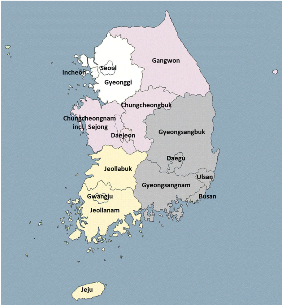
Fig. 2 Korean provinces