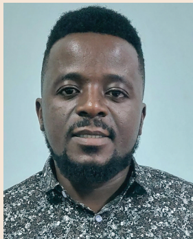
Dickson Otieno Okello

Abstract: The focal point of this study was determining the effect of market orientation on farm performance as moderated by farmer resilience in the volatile dairy sector of an emerging country, Kenya. Using data from 682 respondents found in one of the vibrant dairy production counties in the country, Murang'a County, the study examined the interrelationships between market orientation, farmer resilience, and farm performance. Results from the analysis indicate a significant relationship between all the dimensions of market orientation (competitor orientation, customer orientation and inter-functional coordination) with both farmer resilience and farm performance with the exception of a non-significant relationship between customer orientation and farm performance. The significant relationship between inter-functional coordination and farm performance was the only one that displayed a negative correlation. The findings on the moderating effects of resilience on the market orientation-farm performance relationship report a positive significant effect. As this study represents the first effort to look into the linkages between