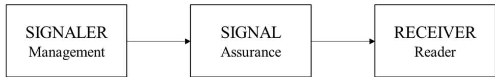
Fig. 1 Signaling model of sustainability assurance, adapted from Connelly et al. (2011, p. 44)

approaches to communicate limited assurance, and therefore readers have difficulties in differentiating between a high and limited level of assurance (Hasan et al. 2005, p. 100).