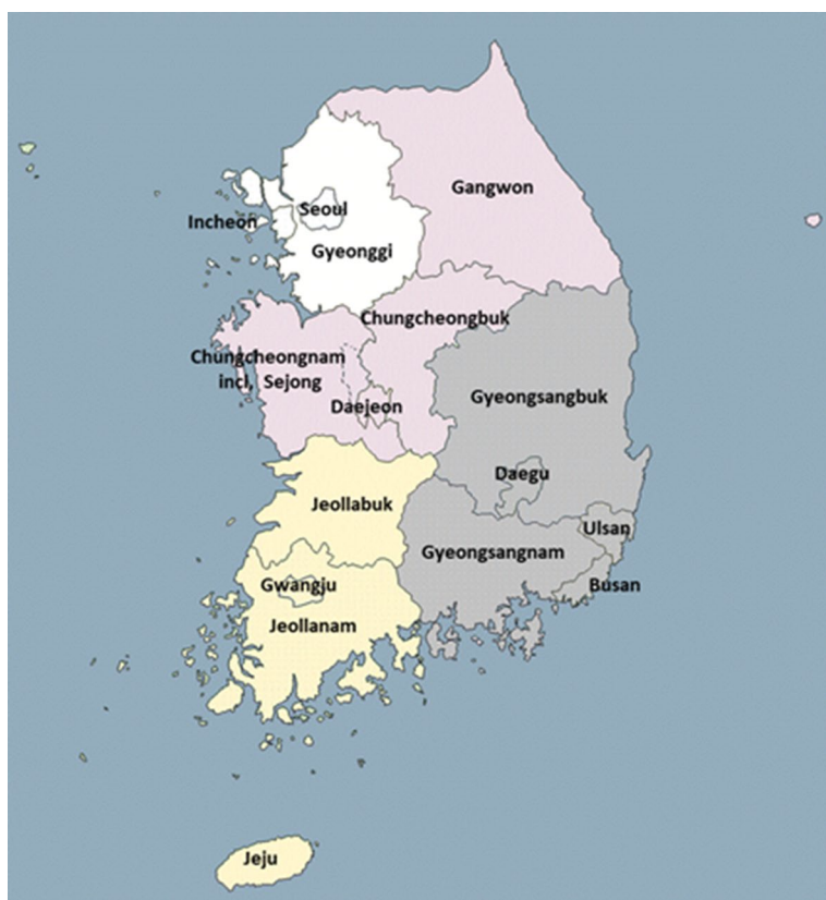
Fig. 3 Korean provinces