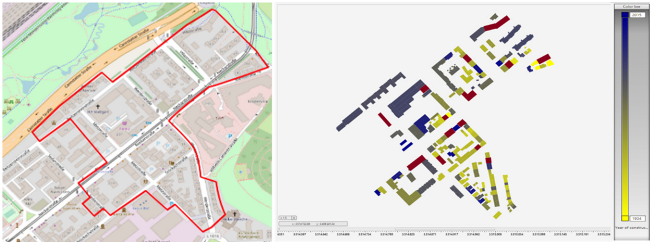
Fig. 1 a Boundaries of grid isle in Stöckach, Stuttgart (OpenStreetMap contributors 2021); b 2D SimStadt GUI colors indicating the building height, yellow=lower buildings, blue=taller buildings, red=some of the missing buildings

electricity consumptions are available for evaluating the demand simulation.