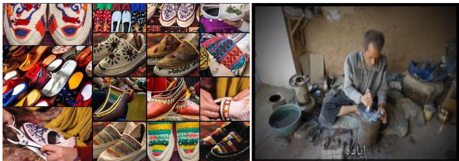
Fig. 3 View of production and products in Abadeh. (Resource: Iranian art entered the world market; The traditional Giveh of Shiraz went to Italy. (2018 August 30) IRIB News Agency, Retrieved from www.iribnews.ir . Shoemaker wearing (Abadeh). (2012 March 28). Fars Central Broadcasting, Retrieved from http://fars.irib.ir )

Businesses in this district produce light, durable summer footwear (Giveh) that is adequate for long walks. The products are sold, especially to villagers and nomads in mountainous and arid regions (e.g., provinces of Fars, Chaharmahal and Bakhtiari, Kermanshah, and Kurdistan). The products are specifically designed for the regional conditions, characterized by the existence of impassable crossings, lack of car roads, livestock, and agriculture-based livelihood. In response to the specific needs, people in nomadic, rural, and semi-urban areas have started to produce goods with the material available in the area. Thus, more than 80% of the raw materials are provided from within the region. Abadeh was the place in which Giveh of the highest quality was produced. Hence, it was very competitive also in markets outside the region. Consequently, local people, due to the favorable income conditions in the production