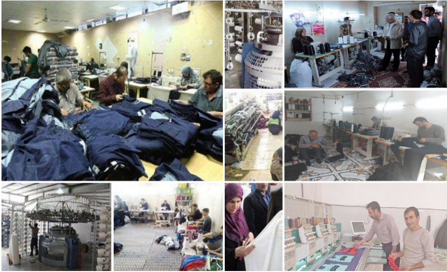
Fig. 5 View of firms in Kerdabad.

printing and cutting fabrics, weaving, and even using various machines, and some of them established a firm around Tehran alone or in partnership. However, these firms faced problems, such as the inability to independently purchase fabrics and raw materials, high rents, miscellaneous expenses such as taxes, family expenses, and being away from family. These factors led to the establishment of a business in Kerdabad village in 2003. In the beginning, there was a problem with the lack of trust by principals and customers in Tehran who provided fabrics and raw materials and distribute and sell the clothes. Once these problems have been solved, the workers in Tehran realized that they could own a firm in the village at low costs and with the help of their family (they often turned their houses into firms). The return process of those who were skilled in various fields of clothing continued. Gradually, related firms were created with different specializations.