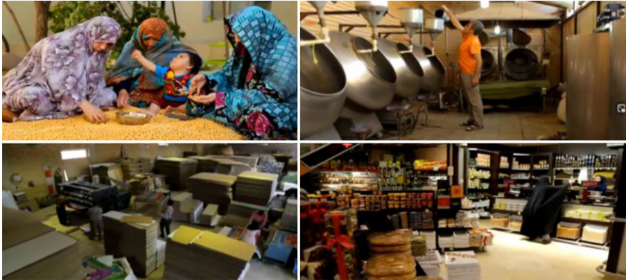
Fig. 4 Production in Mamaqan.

of Giveh, turned from agriculture to the production of this commodity and started to export them. It is worth mentioning that since the organic yarn and leather made by the villagers themselves are used in making Giveh, the product is also sold in European markets.