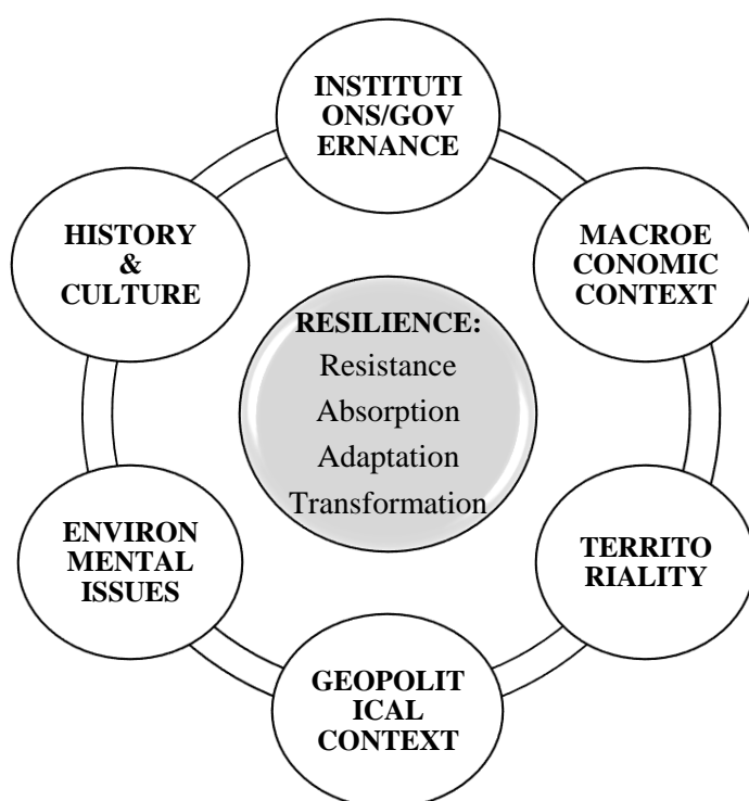
Figure 2. The determinants of resilience