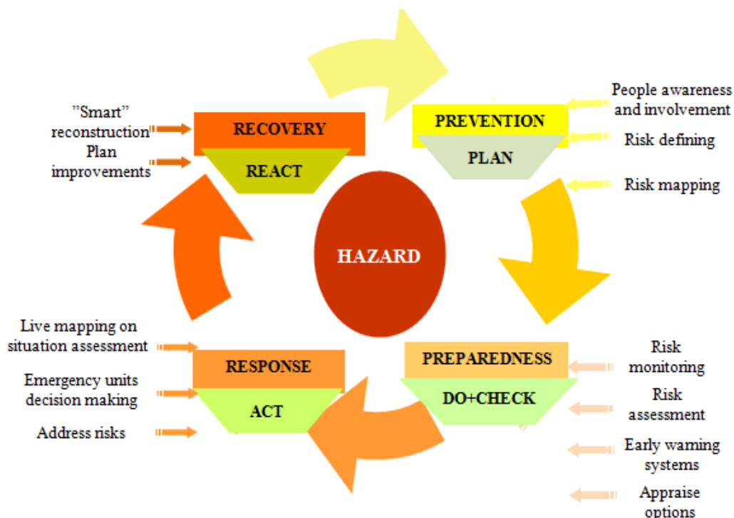
Figure 4. Hazard management cycle