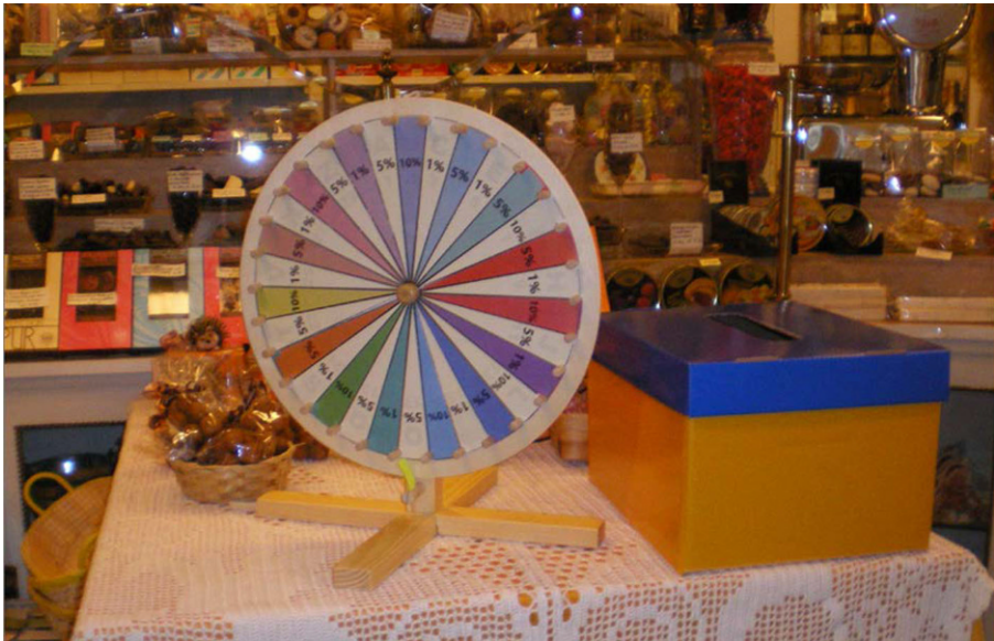
Fig. 2 Setting for Study I (EG1)

being dissatisfied with the outcome of the promotion than in cases with narrower distributions (where more consumers receive intermediate discounts). EG1 represents a narrower distribution with discounts between 1% and 10% but many cases of 5%. EG2 represents a more dispersed distribution and gives possible discounts of 100% to some consumers. These promotions have previously been referred to as “probabilistic free price promotions” (Mazar et al. 2017). However, as the expected discount stays the same, most consumers receive only a very low discount of 1%.