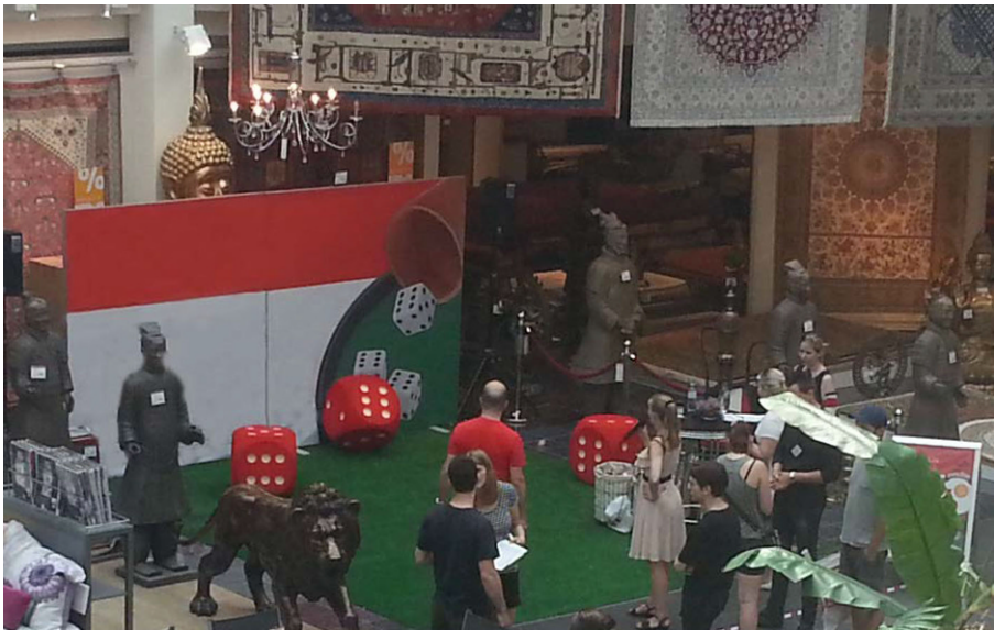
Fig. 4 Setting for Study II (EG)

Trained research assistants intercepted all customers who participated in the promotion (EG). Before the dice were rolled, shoppers indicated their expected discount level. After throwing the dice, the shoppers again answered queries on their discount evaluation, the entertainment value of the promotion, customer satisfaction, WOM intention, and demographics (age, gender). The research assistants observed the purchase value and the outcome of the dice game (i.e., the actual discount achieved).