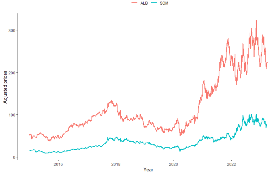
Figure 1: ALB and SQM adjusted prices. Data are downloaded from the Yahoo Finance database.

We conclude that the key metal for the EV battery raw materials market is lithium. However, its prices are not easily available. Even Eikon database does not contain a sufficiently long history of lithium prices that could be used to model returns in the EV battery raw materials market. Also, lithium prices alone may not be enough to investigate the supply chain argument since the largest lithium producers are located in different parts of the world and can have special commitments to particular EV manufacturers.