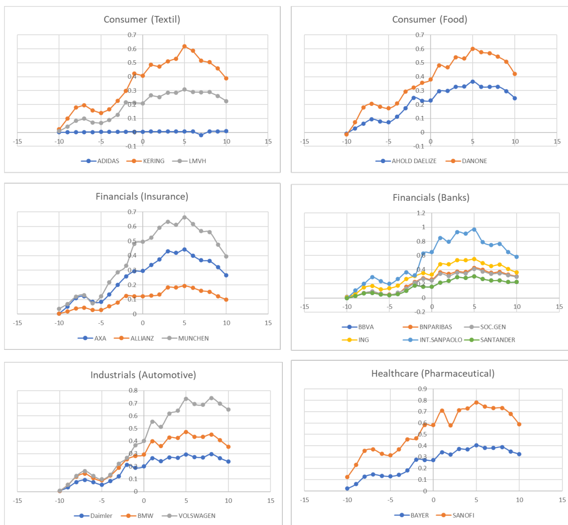
Figure 2. Cummulative Abnormal Return, CAR (-10,10) of selected companies

A positive CAR means that after a piece of news, negative one in our case, there is a difference in price of CDS from the expected one. As a company's credit default swap spread is the cost per annum for protection against a default by the company, CDS are financial instruments that hedge from credit risk, when the risk is higher, the cost of hedging should be higher than expected. There are some results in this sense, Hull et al. (2004) or Andres et al. (2021) found positive adjusted CDS spread changes at a negative rating events (another negative piece of news).