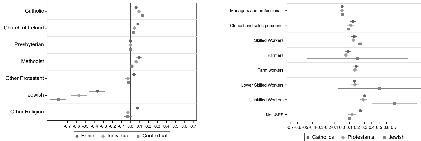
Figure 2 – Estimated Effects of Religion on Child Mortality Index from Basic, Individual, and Contextual Models (coefficients with 95% confidence interval) on the Left Panel and Estimated Effects of SES on Child Mortality Index from Protestants, Catholics, and Jewish Models (coefficients with 95% confidence interval) on the Right Panel.