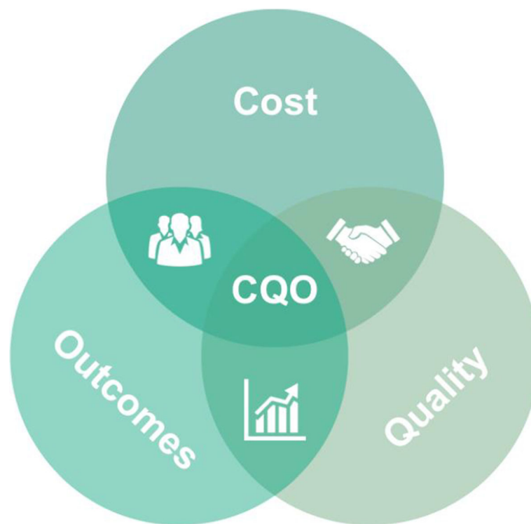
Fig. 1 The Cost, Quality and Outcomes (CQO) Movement's conceptual model