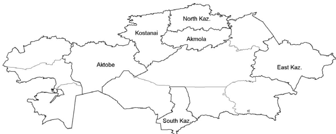
Figure 1: Kazakhstan: Survey regions

In the second stage, between two and four rayons per oblast were selected according to the criteria ‘natural yield potential’ 2 and ‘relative importance of crop production’ 3 . Data from the regional statistical agencies served as a base for the selection process. Moreover, the selection process was supported by the directors of the regional departments of agriculture by providing valuable information on the local research conditions.