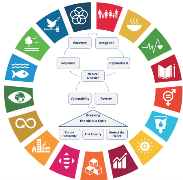
Figure 2 Breaking the Vicious Cycle of Disasters through the Sustainable Development Goals [Color figure can be viewed at wileyonlinelibrary.com ]

describing the problem context, justifying the data used, and clearly discussing how the findings were validated and how they could be applied in the field. We requested the authors to seek feedback from practitioners by asking them to confirm the papers tackle SDG-related issues grounded in reality, and results are useful in the field.