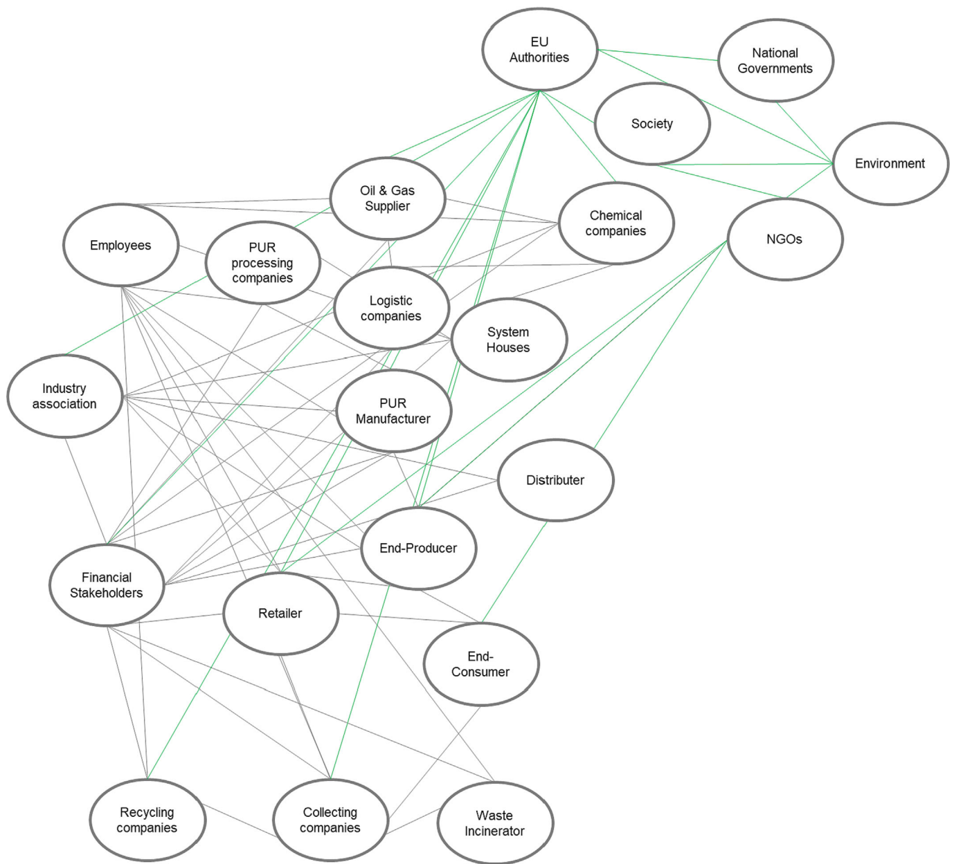
FIGURE 3 Network graph visualizing the type of industry-oriented governance.

It would be a reasonable approach if e.g. you have this chemical, and you cannot make consumer application and toys, but if you want to make plastic pipes for wastewater—this should be allowed.” The Secretary General continued that “from a governance point of view, what is very important, is that when it comes to provide the energy, talking in regard to the green deal and climate neutrality in 2050, the regulators have to provide the environment that the chemical industry can enable it in terms of using renewable energies.” Moreover, the legislative foundations of the use of materials and energy need to be improved in concert since “it is not to push for innovation, it is more to provide the context, the environment, the legal frame that enables innovation, that enables access to renewable energies because the