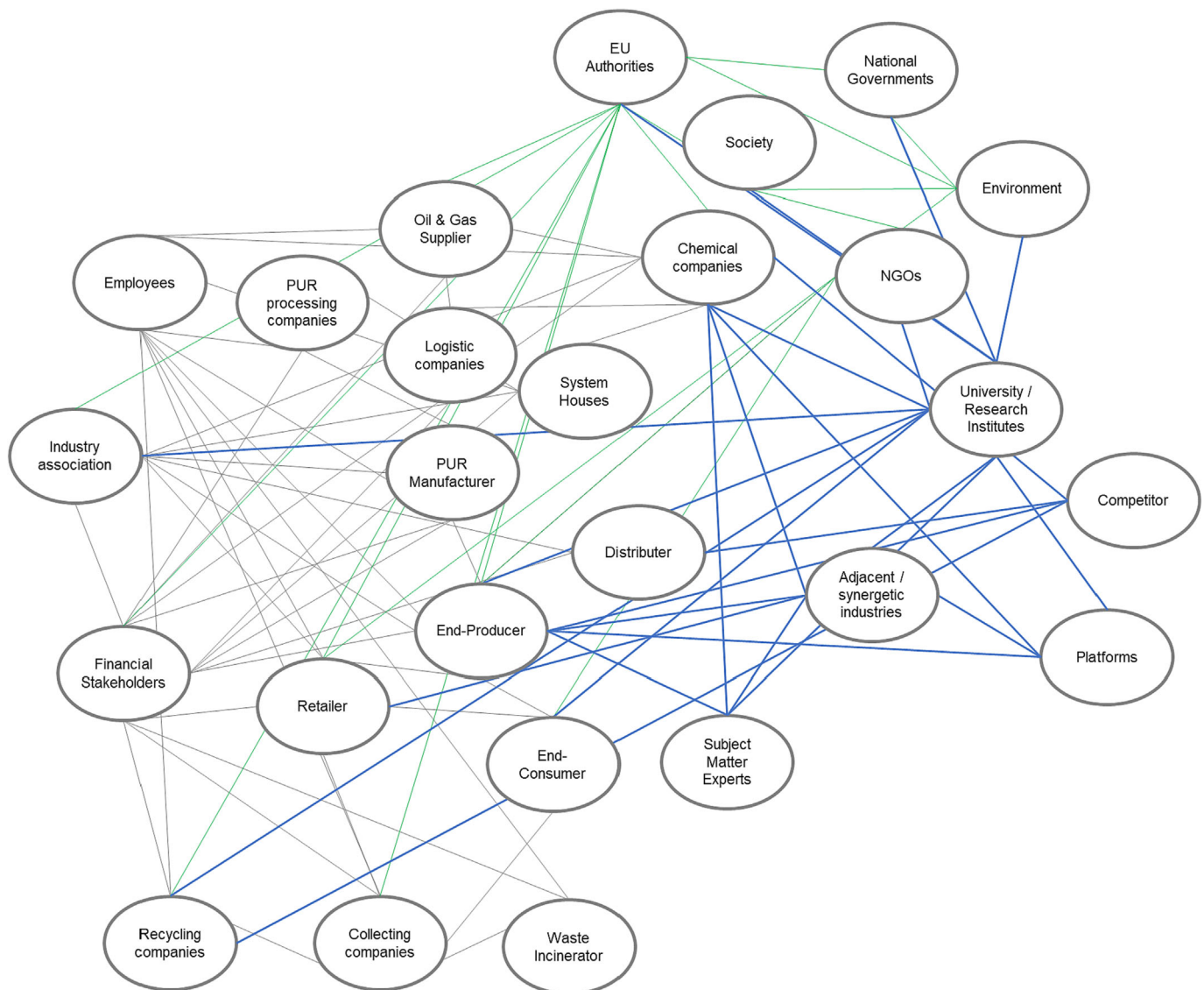
FIGURE 4 Network graph visualizing the type of cross-industry-oriented governance for a CE.

Phillips, & Sisodia, 2020), whereas the practical implications of stakeholder management have tended to be limited to the level of the firm. We address this problem by showing that stakeholder collaborations may promote positive systemic change, specifically the change entailed in the rise of a CE. While some stakeholder collaborations for CE may be company-centric and thus potentially affected by the problem of trade-offs, other collaborations are collectively governance-oriented and utilize new collective governance structures to overcome the trade-offs that emerge (see Table 2). These innovative governance structures do not interfere with the profit-seeking objectives of individual companies but modify the institutional constraints faced by these companies in such a way that their profit-seeking orientation no longer causes their interests to collide.