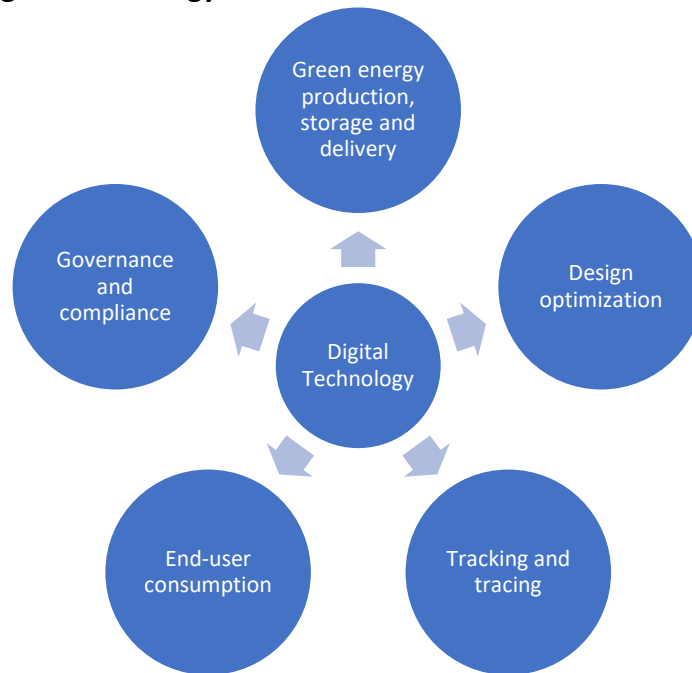
Figure 1. How Digital Technology Enables Business Transformation