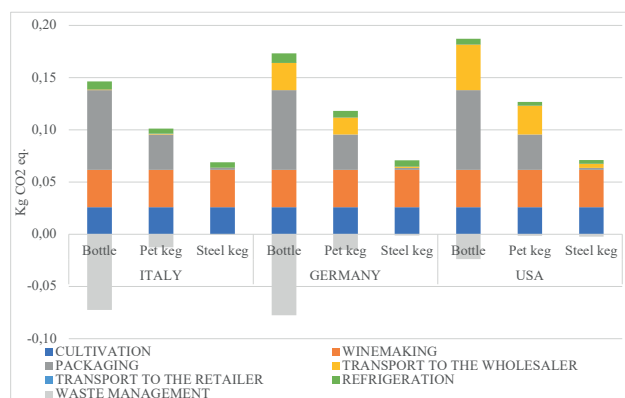
Figure 3. Climate change: environmental impact of glass bottle, PET keg and steel keg in the three scenarios considered (Italy, Germany and USA).

Also considering waste management, glass bottles can become competitive again in Italy and Germany, thanks to the high level of recycling of this material and the low percentage of landfill disposal.