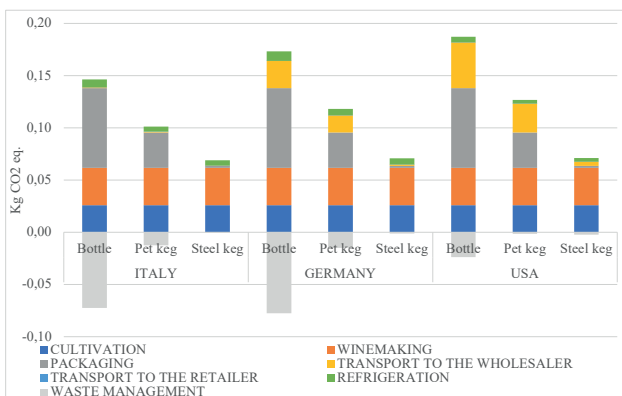
Figure 3. Climate change: environmental impact of glass bottle, PET keg and steel keg in the three scenarios considered (Italy, Germany and USA).

Also considering waste management, glass bottles can become competitive again in Italy and Germany, thanks to the high level of recycling of this material and the low percentage of landfill disposal.