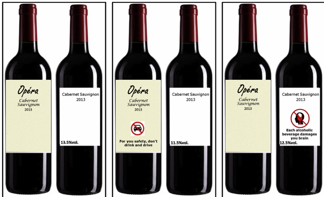
Figure 1. An example of choice task. Imagine you are at the supermarket to buy a bottle of wine to bring to a dinner with friends. You will see 4 groups of 3 bottles sold at the same price. We will show you both the front and the back of these bottles of wine. For each group, please choose the bottle of wine you prefer.

Imagine you are at the supermarket to buy a bottle of wine to bring to a dinner with friends. You will see 4 groups of 3 bottles sold at the same price. We will show you both the front and the back of these bottles of wine. For each group, please choose the bottle of wine you prefer.