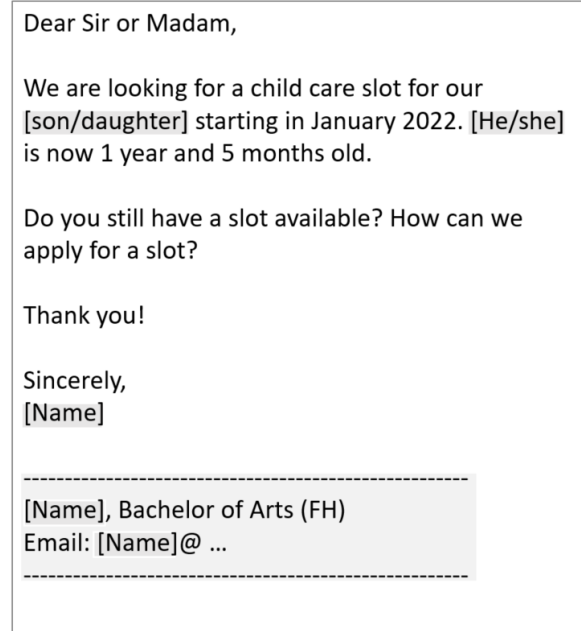
Figure 1: Email Template with Randomized Information Highlighted

Notes: Figure shows the email sent from fictitious parents to child care centers, translated from the original German version. Text marked in grey is randomized and differs by version of the email. We randomized the gender of the child (2 variations), the name of the parent (16), and whether or not we include an email signature (2). The signature indicates that the parent holds a bachelor's degree from a University of Applied Sciences, which is the most common higher education degree in Germany. We sent a total of 64 ( 2 \times 16 \times 2 ) different versions of the email to child care centers.