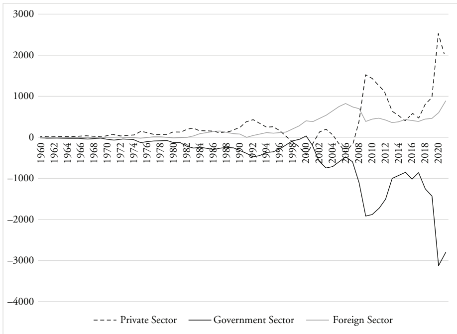
Figure 1 US inflation and net federal government lending/borrowing 1962–2021