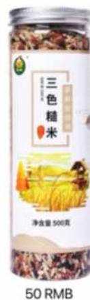
Figure 1: Example of picture of gift shown to subjects

Both Money and Gift contained 3 sub-conditions, varying in the value of the incentive: 50, 200, or 800 RMB. We label these treatments M50 , M200 and M800 for Money and G50 , G200 and G800 for Gift . The middle incentive level of 200 RMB was chosen to be in line with what had been implemented in Shanghai (Zhang, 2021). At the time of the experiment, the three incentive levels equated to about 7.85, 31.50 and 125.90 USD respectively.