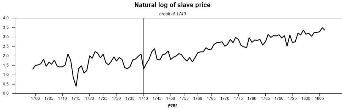
Figure 1. Slave prices

Notes: The gridline gives the position of the structural break in the deterministic trend of the data.