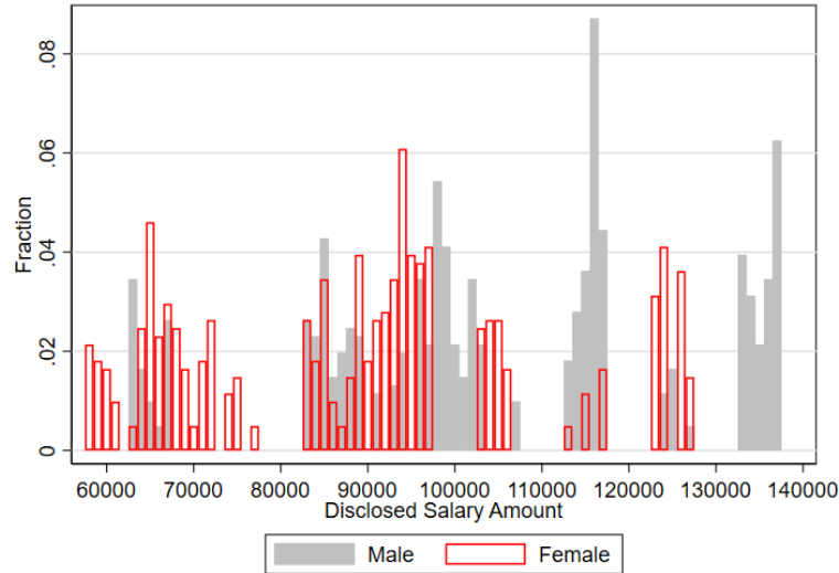
Figure 1: Distribution of Disclosed Salary Amounts

Notes: This figure shows the distribution of male and female salaries (among the job applications containing a disclosure). The mean disclosed salary amongst those who disclosed was $89,565 for female candidates and $104,638.