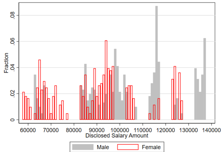
Figure 1: Distribution of Disclosed Salary Amounts

Notes: This figure shows the distribution of male and female salaries (among the job applications containing a disclosure). The mean disclosed salary amongst those who disclosed was $89,565 for female candidates and $104,638.