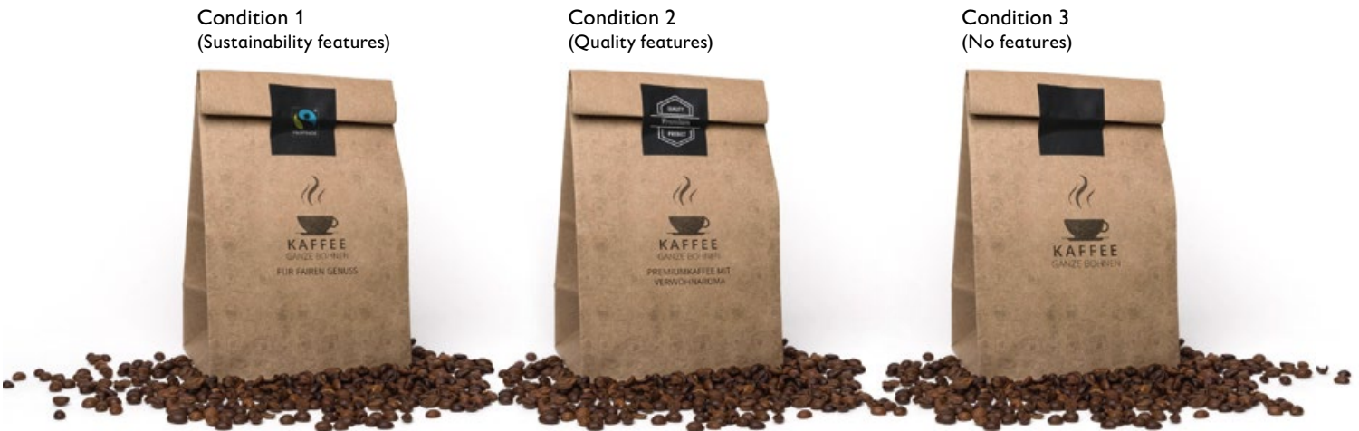
Fig. 1: Illustration of the Experimental Conditions, Exemplified by the Coffee Beans in Study 2