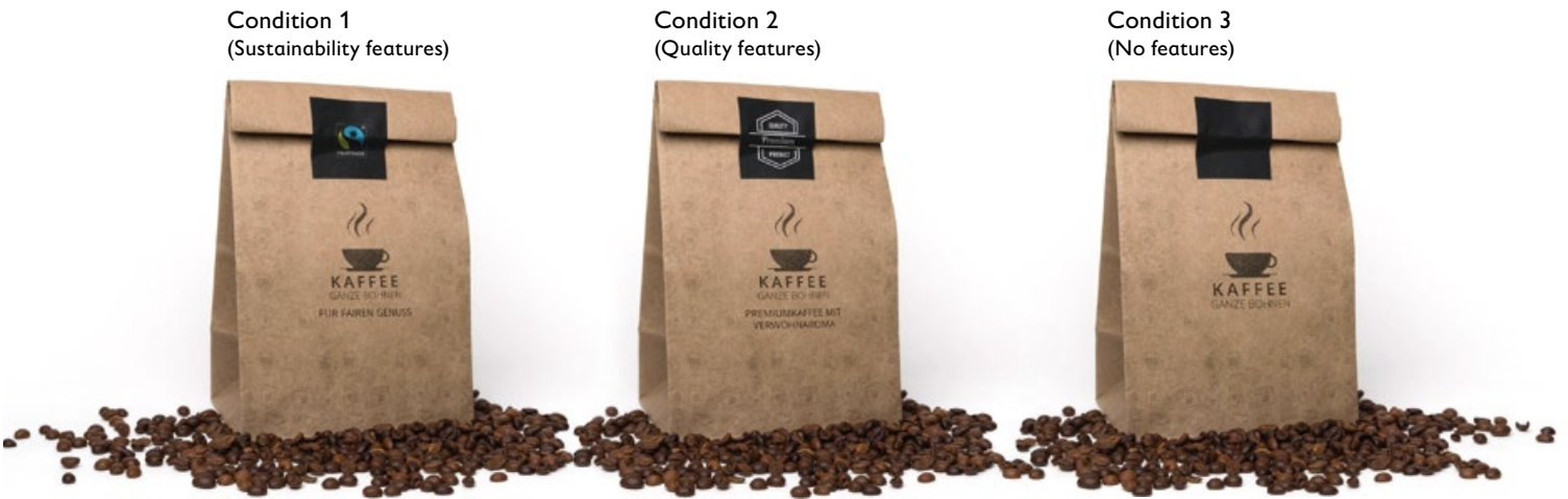
Fig. 1: Illustration of the Experimental Conditions, Exemplified by the Coffee Beans in Study 2