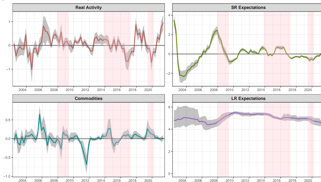
Figure 2: Contributions of hemispheres to inflation estimate

Note: contributions of real activity, short-run expectations, commodities, and long-run expectations to inflation over time. Dashed lines represent the beginning of the out-of-sample period. Recessions (business cycle turning points as retrieved from the SARB) are depicted in pink. The grey shading represents the 68% credible region.