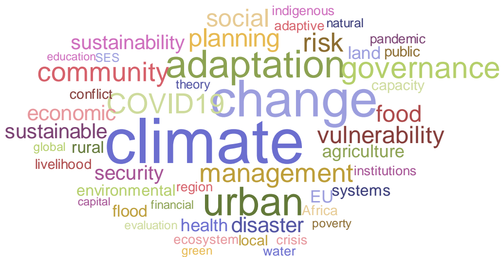
Figure 2: Frequency-based word cloud of journal article keywords tied to resilience