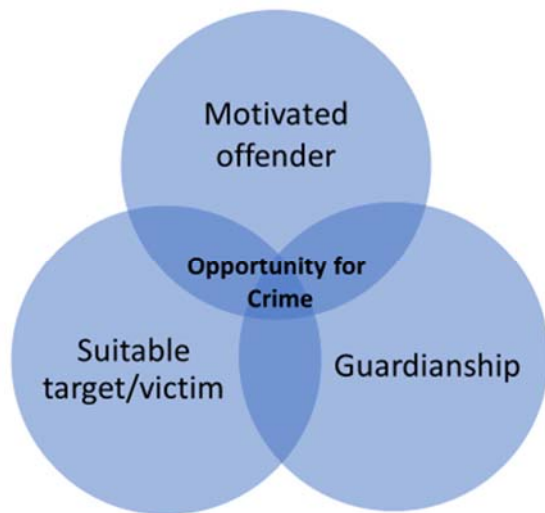
Figure 1. The routine activity approach