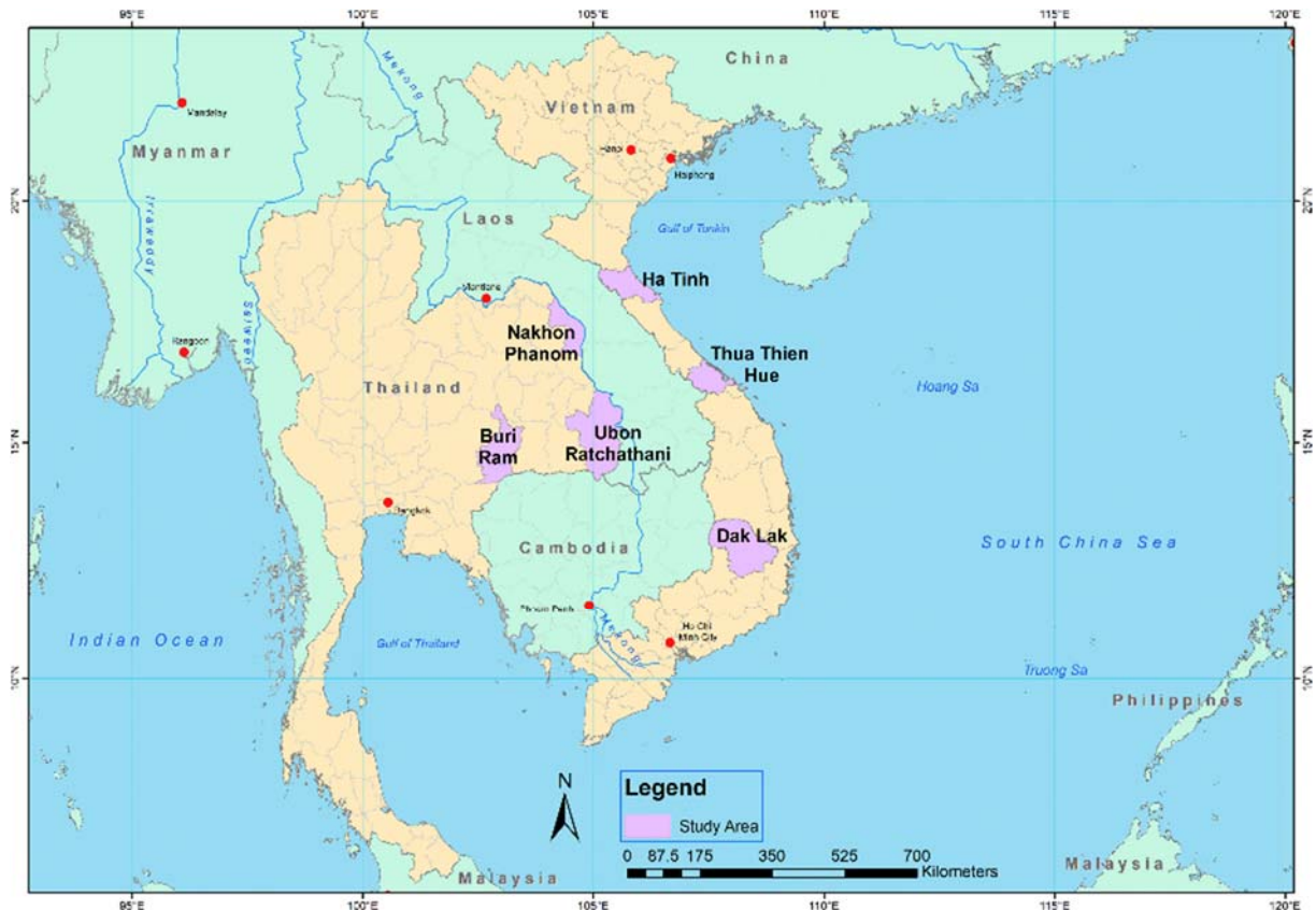
Figure 1. Study sites of the TVSEP project in Thailand and Vietnam

The TVSEP project uses two survey instruments to collect information at household and village levels, namely a structured household questionnaire and a structured village questionnaire. The household questionnaire includes a wide range of information such as household demographic characteristics (e.g., age, education, employment, and health status), household's income and livelihood strategies (e.g., crop and livestock production, natural resource extraction, wage-employment, and self-employment), household's consumption, household's assets, and shock experience. The reference period is normally from May of the previous year to April of the survey year. For each sampled household, the household head was interviewed. The village questionnaire captures the information at village level such as irrigation (if year-round irrigation is available, and the water sources of year-round irrigation), infrastructure (such as road quality), and the distances from the villages to the closest markets, to district centers, and to provincial centers (see Table A1 in the supplemental data for definition and measurement of variables at household and village levels). For each sampled village, the village head was interviewed.