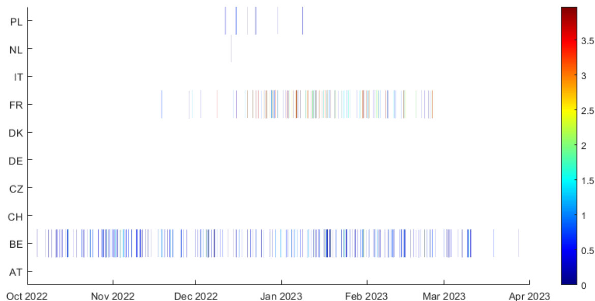
Figure 2: Expected energy not served (EENS) per hour in MWh for the reference scenario S1 with consideration of cross-regional exchanges

scenario S1. This is unquestionable despite the fact that the reliability standards are set for a full year whereas the calculations focus on the winter half year. But typically load and residual load attain their maximum during the winter half-year so that two times the numbers indicated in Table 2 is an upper bound to the annual LOLE.